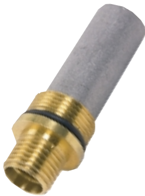
VanGuard™ Replacement Cartridge

Note: Flashback arrestor replacement cartridges include an "O" Ring but does not include a replacement reverse flow check valve. Part No. 0690-0027 - 9/16" (pair)