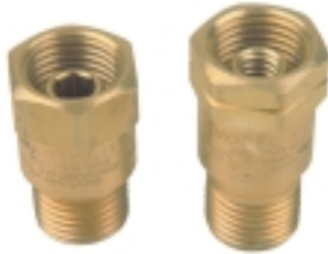
Check Valve - Pair Pak