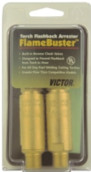
FlameBuster™ Pair Pak