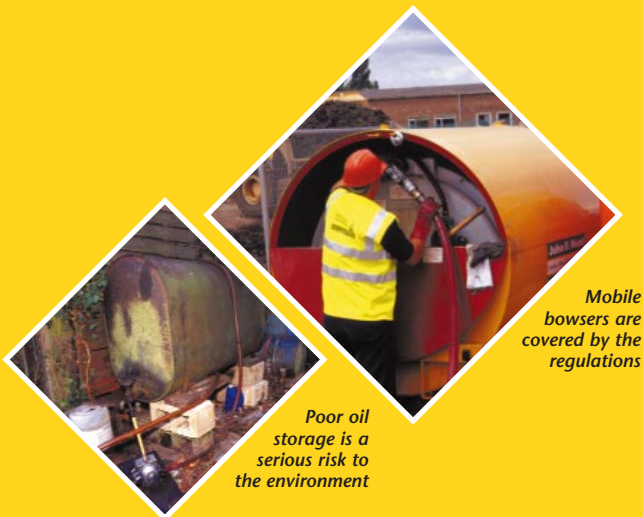
Mobile bowers are covered by the regulations

The regulations set out the requirements to be met for the safe storage of oil in containers above ground. This leaflet does not cover all the details of the regulations. You should refer to the regulations themselves to obtain full information – see Further Information.