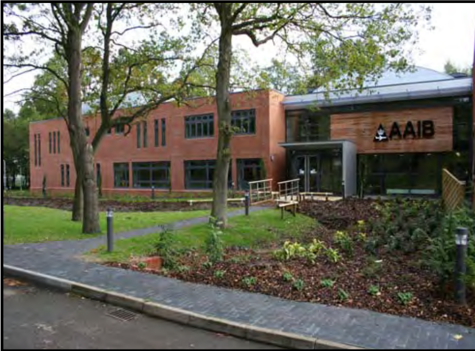
AAIB HQ at Farnborough

General enquiries , of a less urgent nature, should be made via: