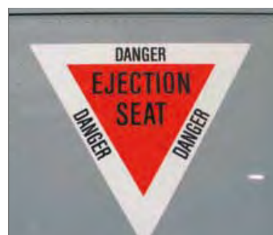
Ejection seat warning on Military aircraft

Under normal circumstances, the words "EJECTION SEAT" contained in a bright red inverted triangle, located on either side of the cockpit fuselage is an indication that the aircraft is fitted with ejection seats.