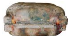
Damaged flight recorders