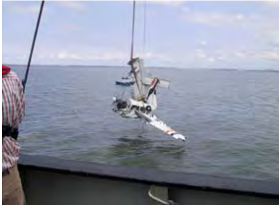
Wreckage recovery from the sea in good weather conditions

The AAIB will confirm with the organisation, managing the salvage project on its behalf, that the capabilities and experience of the diving contractor and his team are appropriate for the work being undertaken. This also applies to Royal Navy and Police teams.