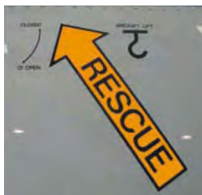
Military aircraft rescue markings

For the purpose of rescue, the location of access doors, hatches, break-in points and cut-out panels are generally indicated on the external surfaces of military aircraft by a yellow arrow, bordered black.