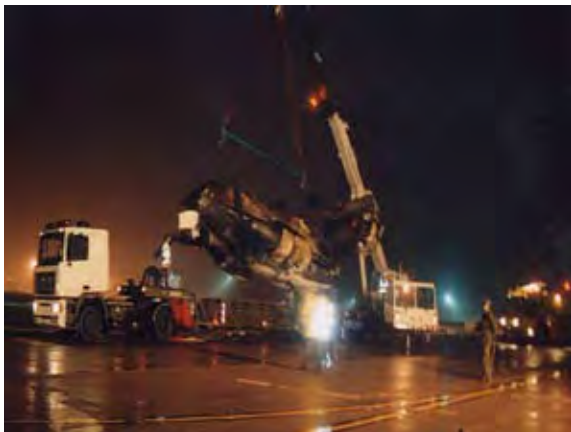
Typical wreckage recovery operation

Recovery of the wreckage of public transport aircraft will normally be co-ordinated by the AAIB, often with assistance from the Royal Air Force or Royal Navy. A recovery officer from one of these organisations may attend the site at an early stage to assist the investigation team and to assess the recovery resources required. Recovery of the wreckage of light aircraft and small helicopters may also be undertaken by local contractors or by AAIB personnel.