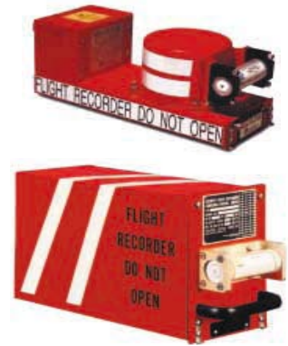
Examples of recorders

The retrieval of the recorders after an accident is of prime importance, but electromagnetic devices of the 'mine-detector' type should not be used to search for these recorders because electro-magnetism can erase the recorded information.