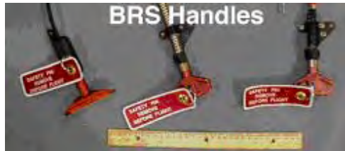
BRS activation handles

A red firing handle , connected by flexible cable to the igniter in the activation housing, is located near the pilot seats.