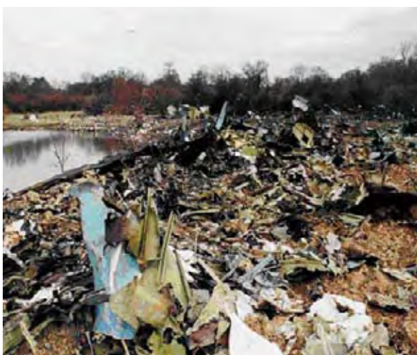
Example of an aircraft accident site