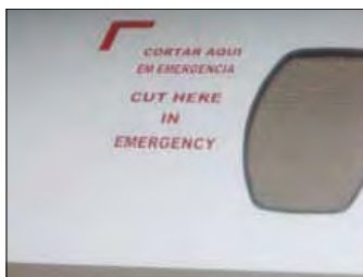
Emergency cutting area on aircraft fuselage