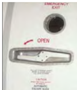
Typical external door handle

The position of emergency equipment on aircraft, which is accessible from outside the aircraft, is generally indicated by a silhouette with an associated written description. Where a first-aid kit is carried, its marking will be found adjacent to an access panel or exit from which the kit is accessible.