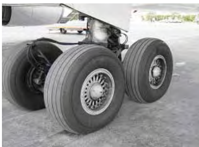
Commercial aircraft tyre pressures can exceed 250 psi

These assemblies can explode with devastating violence, particularly if fire has occurred. Tyre assemblies are best approached from fore or aft.