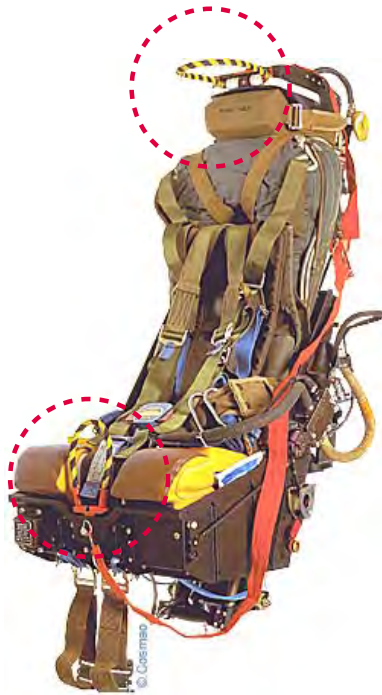
Typical ejector seat fitted to older UK ex-military aircraft

Special consideration must be made concerning wing mounted fuel tanks, armament pods, landing gear legs, tyres and pressure vessels (gas bottles)