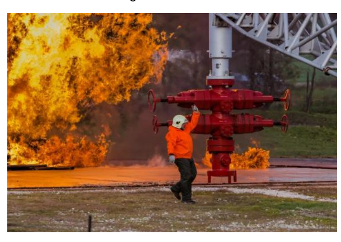
One of the demonstrations

foams for storage tank application, advancing technology in foam manufacturing etc.