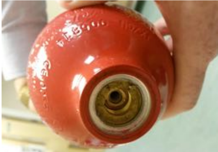
Threaded section remaining with cylinder neck of the exploded extinguisher in Dublin

levels of degradation under certain conditions over time. This causes the valve assembly to separate from the steel cylinder during handling, inspection or maintenance and could also result in the siphon tube separating from the valve during normal operation, affecting the discharge performance.