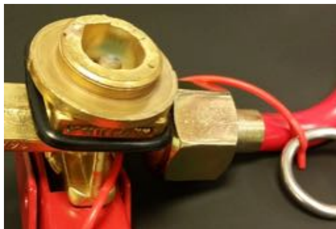
Detail from the extinguisher that exploded in Dublin

There have been a number of incidents where fire extinguishers have exploded - usually due to incorrect manufacture and/or incorrect maintenance. In one such incident involving carbon dioxide (CO 2 ) extinguishers, it was determined that the thread area on certain valve assemblies installed in welded steel cylinders can be subject to various levels of degradation under certain conditions over time. This causes the valve assembly to separate from the steel cylinder during handling, inspection or maintenance and could also result in the siphon tube separating from the valve during normal operation, affecting the discharge