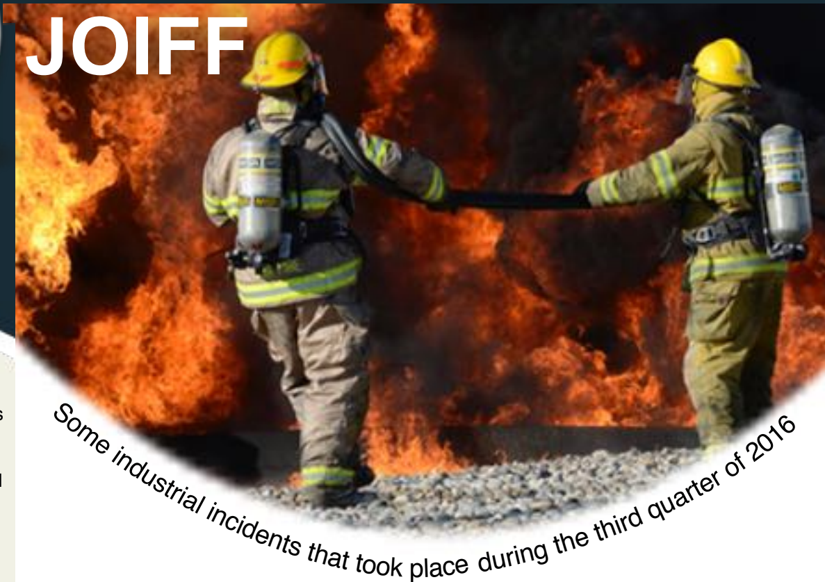
Some industrial incidents that took place during the third quarter of 2016