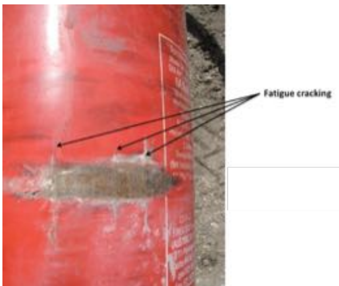
Extinguisher showing signs of fatigue cracking

Surveys carried out by the fire extinguisher industries in the United Kingdom (UK), Europe and United States of America (USA) have shown the effectiveness of fire extinguishers.